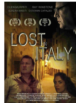
'Lost in Italy' - out in 2012