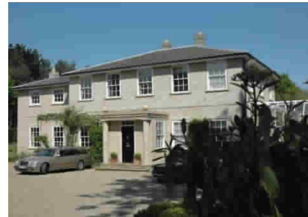
Rowan House, Westleton. Nice...