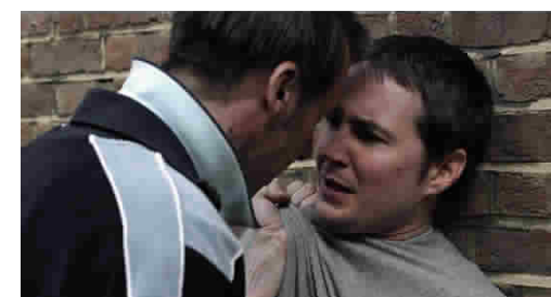
Martin Compston gives an award winning performance