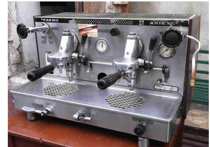
Before and after, a locally sourced period coffee machine looks as good as new after being stripped down and cosmetically refurbished for use in the Piazza's 'Cafe Palombaro'...