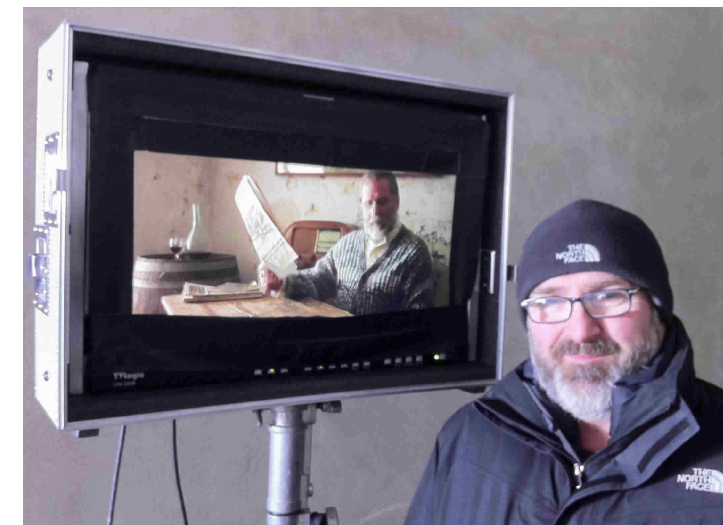
That complexion isn't a suntan! It's pretty windy up those mountains in December... Sponsored by 'North Face' (I wished!)