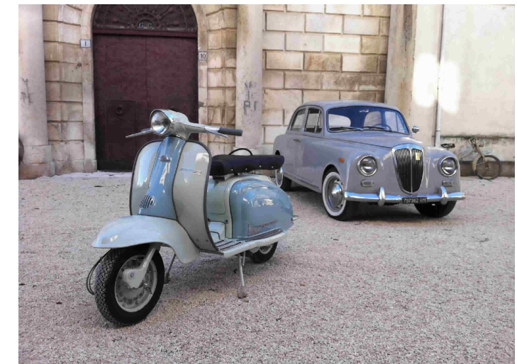
Again sourced locally, an immaculate '53 Lamberetta and a mint '52 Lancia help to set the scene...